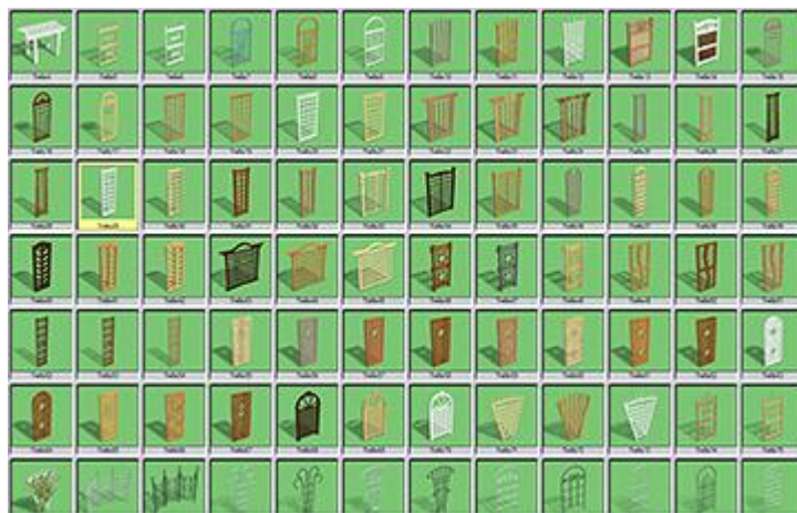
Over 200 new accessories