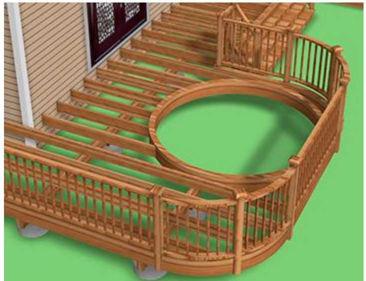
New boolean commands for creating complex shapes.