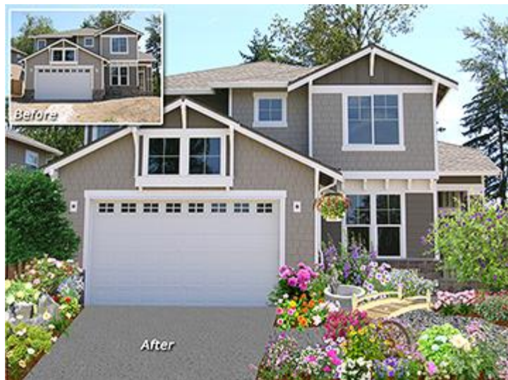
Includes the full version of Realtime Landscaping Photo 4.