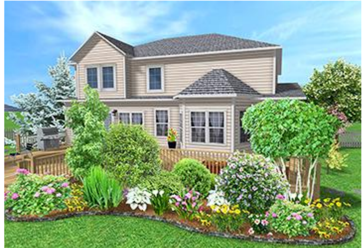
Now over 8200 objects.

The new Lot Boundary tool makes it easier to enter relative dimensions and survey bearings.