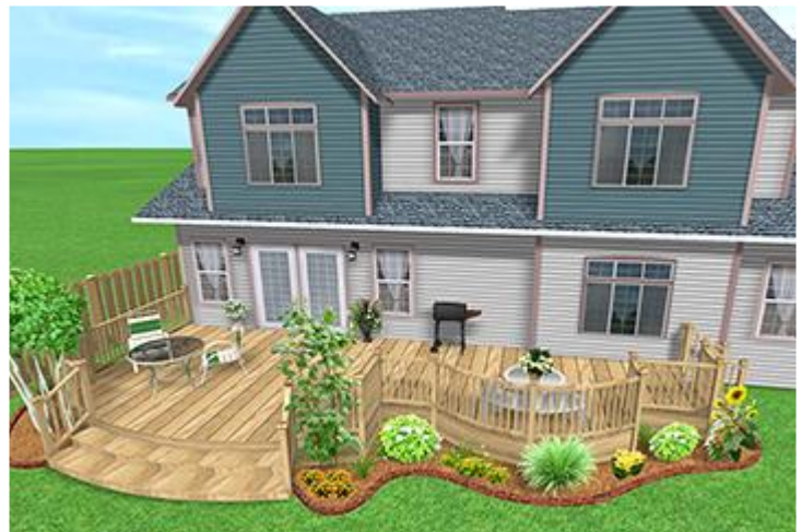
Curved decking, railing, and wrap-around stairs.